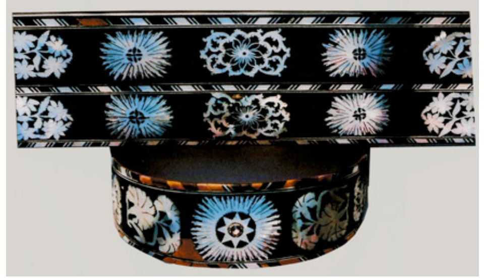
New parts made of engraved mother-of-pearl after restorations.