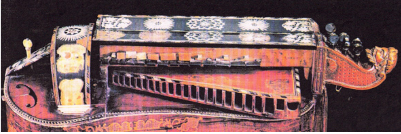
5 missing pieces of mother-of-pear on the cover-heel and the cover peg-boxes.